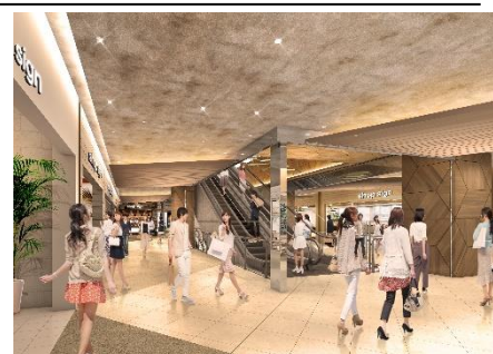
2F commercial floor image