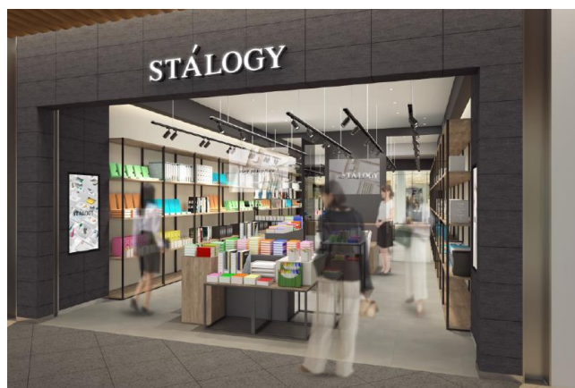
*Image of shop